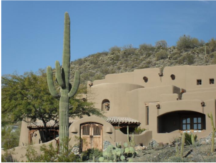
Fountain Hills Home