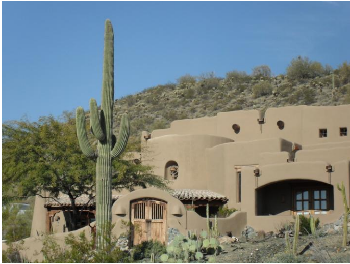
Fountain Hills Home