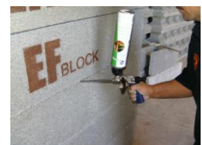
Spot Glue It