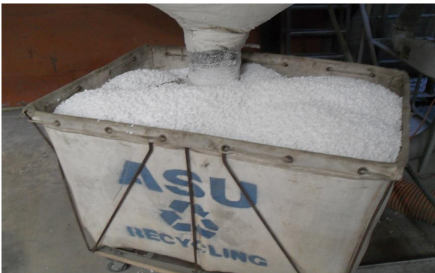
Ground up EPS, Ready to make EF Block!