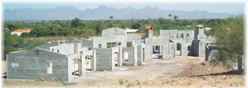
Home Under Construction