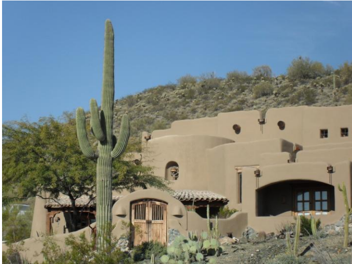
Fountain Hills Home