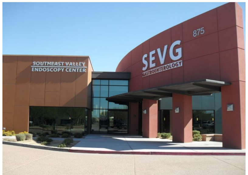
Chandler Medical Center

Your project will be basically solid concrete walls, reinforced with rebar for structural strength.